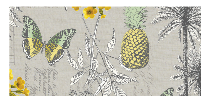
Table runner - 11" x 69" square (30cm x 1.75m) Place mats 11" x 14" (30cm x 35cm) Designed by Lynne Goldsworthy of lilysquilts.blogspot.com using the Fern Garden collection from Makower UK www.makoweruk.com