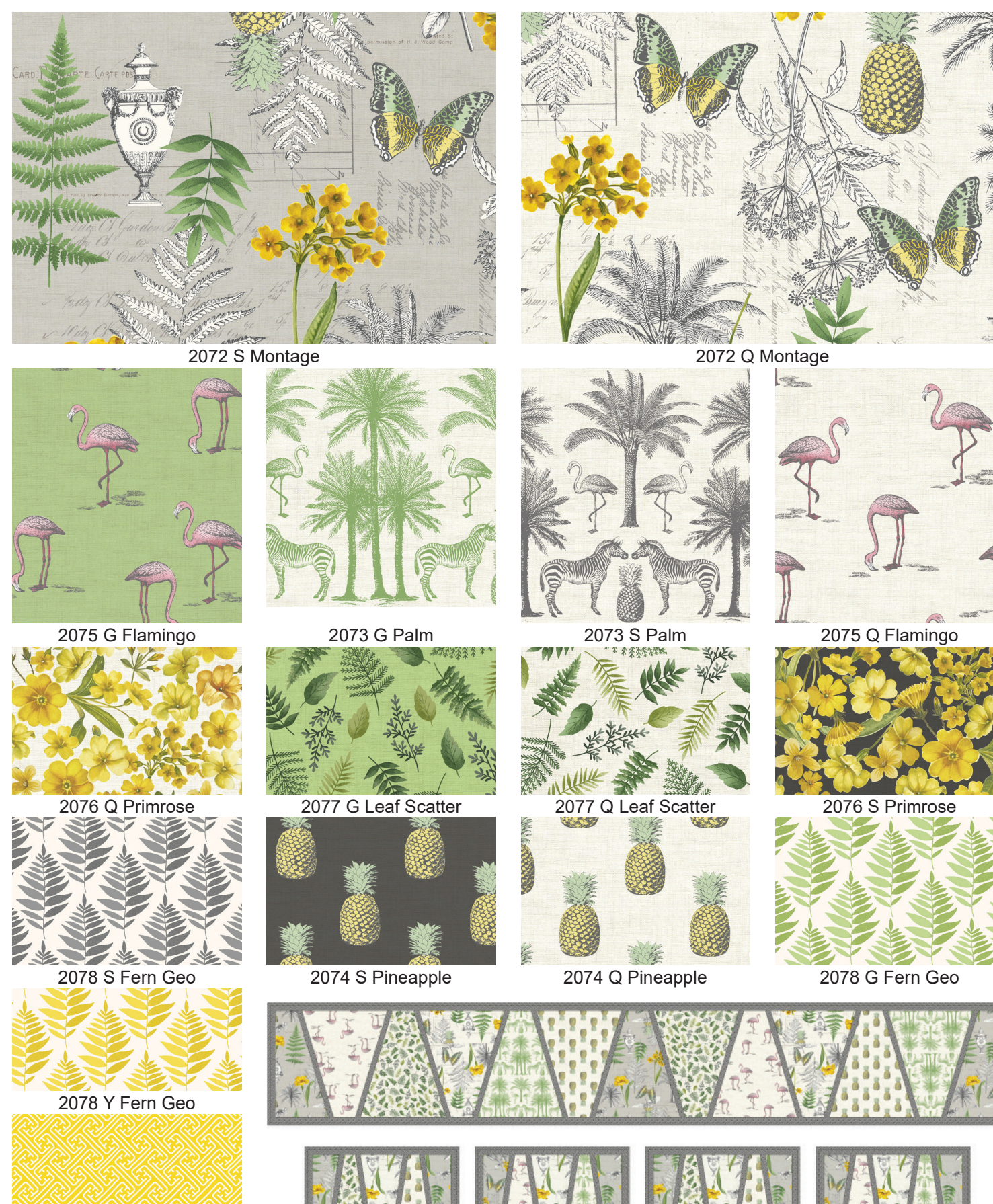
Table runner - 11" x 69" square (30cm x 1.75m) Place mats 11" x 14" (30cm x 35cm) Designed by Lynne Goldsworthy of lilysquilts.blogspot.com Free instructions available to download www.makoweruk.com